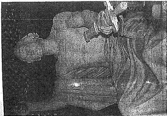
This statue of George Washington, now in the Smithsonian Institution, exemplifies the manner in which textbooks would portray every American hero: ten feet tall, blemish-free, with the body of a Greek god.

mythic figure, the “woman who overcame”—but for what ? There is no content! Just look what she accomplished, we’re exhorted—yet we haven’t a clue as to what that really was.